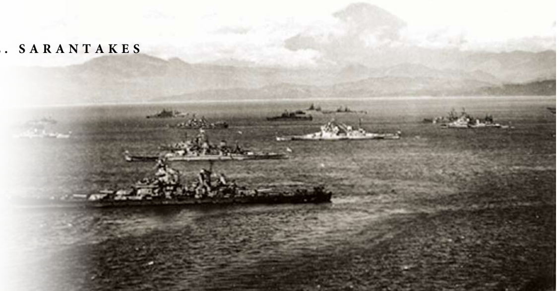
British warships with U.S. Third Fleet off coast of Japan preparing for Japanese surrender