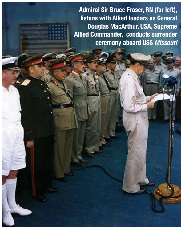
Admiral Sir Bruce Fraser, RN (far left), listens with Allied leaders as General Douglas MacArthur, USA, Supreme Allied Commander, conducts surrender ceremony aboard USS Missouri