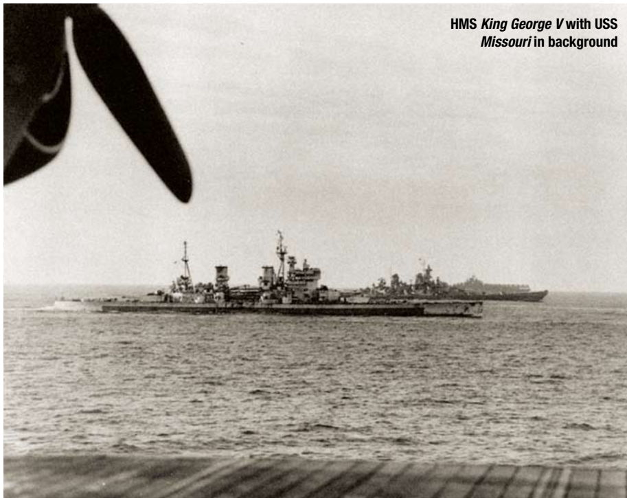
HMS King George V with USS Missouri in background

The third period of combat operations for the British Pacific Fleet started on July 17, the day after it joined up with the Third Fleet. While bad weather forced the Americans to cancel their attacks, Task Force 37 had better luck. Planes from the Formidable and Implacable bombed and strafed airfields and rail facilities on the east coast of Honshu, the biggest of the home islands. No fighters greeted these planes, but antiaircraft fire from the ground was heavy. 24